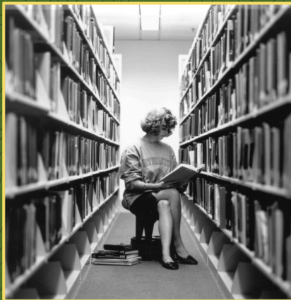
This could be you!